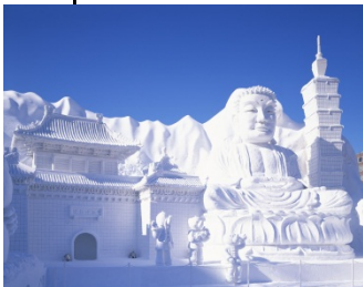
Snow Festival in Sapporo

The capital city, Sapporo, is famous for the Snow Festival held in early February, with many large sculptures made of snow and ice on display, forming spectacular scenes. Hakodate, a large city in the south of Hokkaido, is noted for its beautiful night views. Within Japan’s system of prefectures, Hokkaido alone is categorized as a “circuit,” though it is the equivalent of a prefecture.