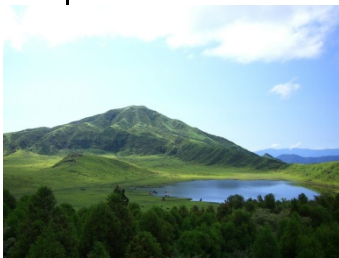
Mount Aso in Kumamoto Prefecture

Two cities in Japan—Hiroshima, in the Chugoku region, and Nagasaki, in the Kyushu region—underwent atomic bombings during World War II. Near the Peace Memorial Park in Hiroshima stands the Atomic Bomb Dome, which was registered as a World Heritage site in 1996.